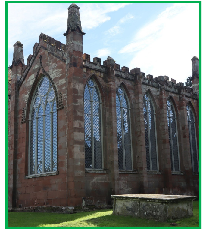
The Howard Chapel from outside.