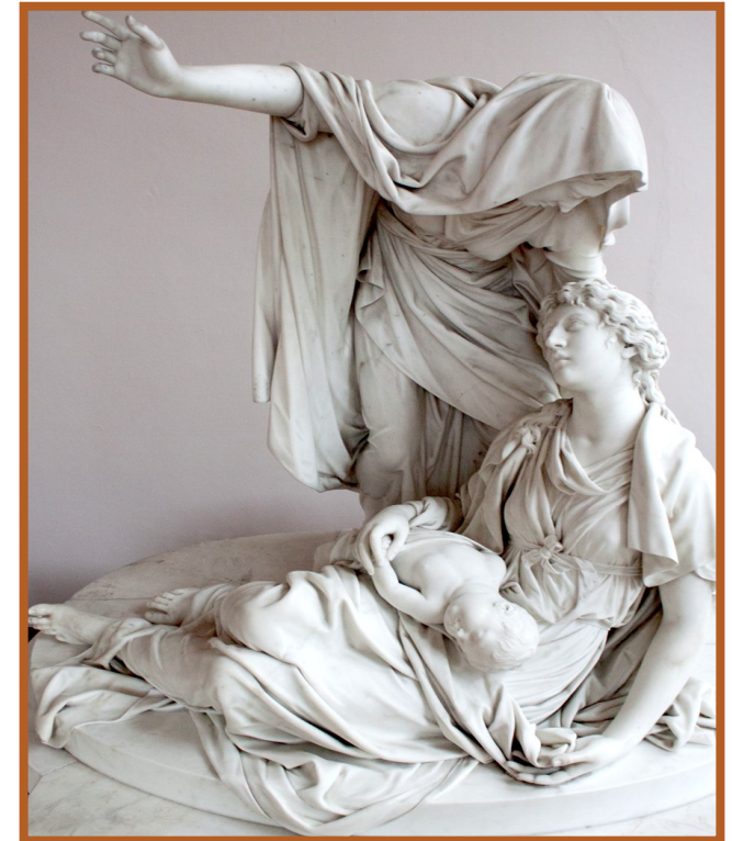
In the Howard Chapel