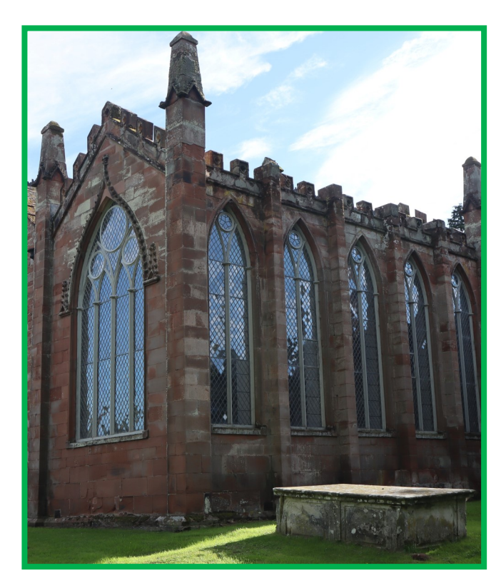
The Howard Chapel from outside.